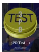
3PO TEST 1

Q1 The key to successful 3PO is one word: TRUST, you must trust your partners'.